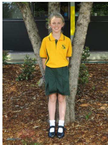
Girls Summer Uniform (Option 2)