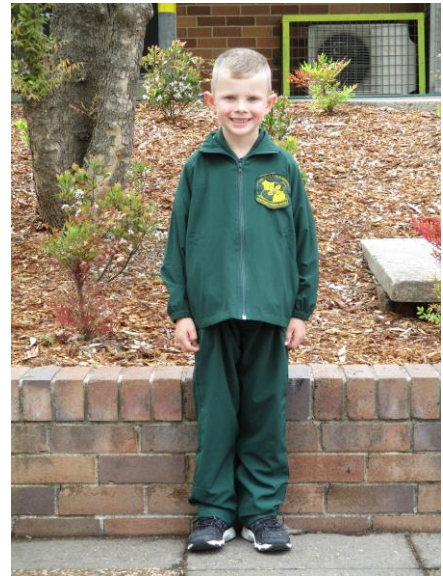
Sports Uniform (To be worn on sports days only, not on fitness days.)