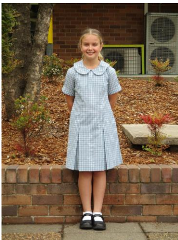
Girls Summer Uniform (Option 1)